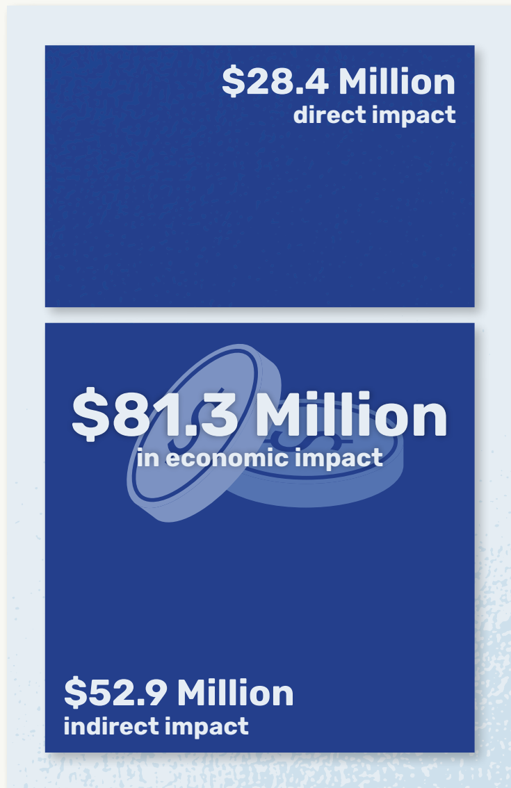
Table 7: Direct and Indirect Employment Driven by the Presence of the Pitt-Bradford, 2021

The overall economic impact of the Pitt-Bradford operations on Pennsylvania in FY '21 was $81.3 million ( $28.4 million direct impact and $52.9 million indirect and induced impact).